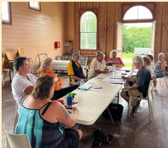
February meeting of the RRPAA

There are some exciting projects being undertaken for 2025 so all willing hands to help move these along are welcome. With a stronger membership base supporting the endeavours and objectives of the Association, so much more can be achieved for Ravenswood.