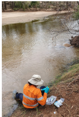
Right: Environment Department undertaking routine monitoring.