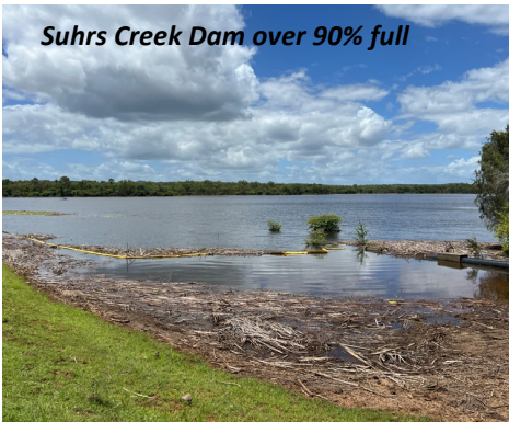
Suhrs Creek Dam over 90% full

Within the first four days of February, Ravenswood Gold's weather station measured 153mm of rain which was above the entire months average rainfall. This gave a healthy boost to Suhrs Creek Dam levels. Before the rain event it was 47% full and is now sitting above 90%. The upside of the wet season is the lush greenery blanketing the town. The down side is road washouts. Please be careful as you drive around unsealed roads. A full dam sets us up well for the dry season and to ensure we can get through to the next big wet, be aware water restrictions still apply. Check the Council website for potable water use under the current Level 0 restrictions.